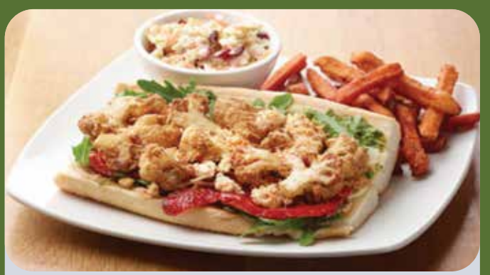
Cauliflower Sandwich, Silver Diner