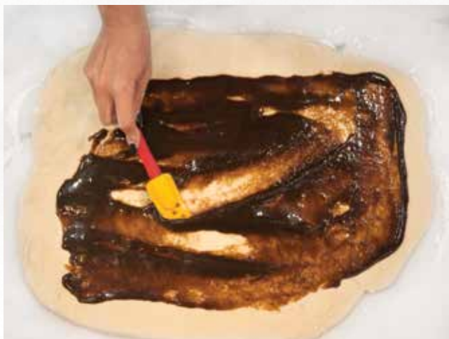
Spread Filling ◀

Total calories per serving: 218 Fat: 8 grams Carbohydrates: 31 grams Protein: 4 grams Sodium: 180 milligrams Fiber: 1 gram