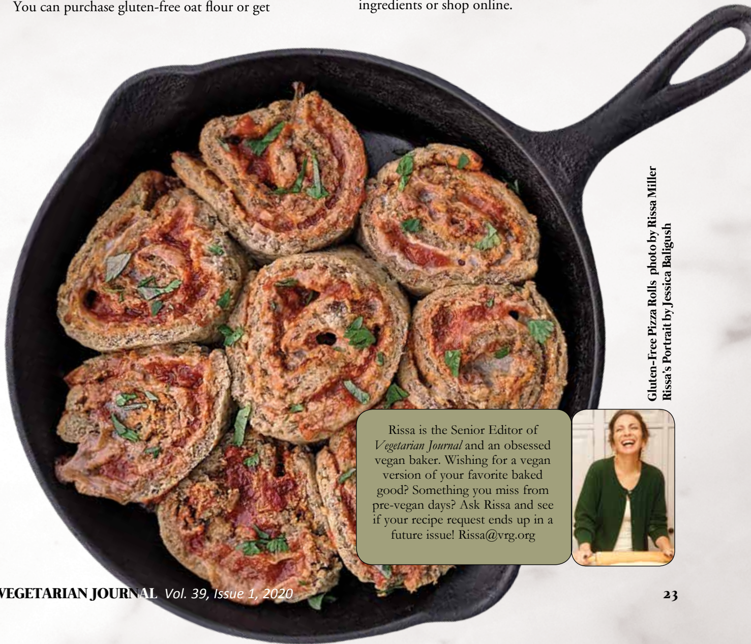
Gluten-Free Pizza Rolls photo by Rissa Miller Rissa's Portrait by Jessica Baligush

Looking for some of the more unusual ingredients in this recipe, like xanthan gum or psyllium husk powder? Many natural products stores carry these ingredients or shop online.