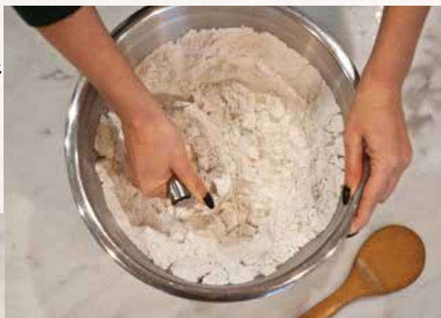
Cutting Margarine Into Flour